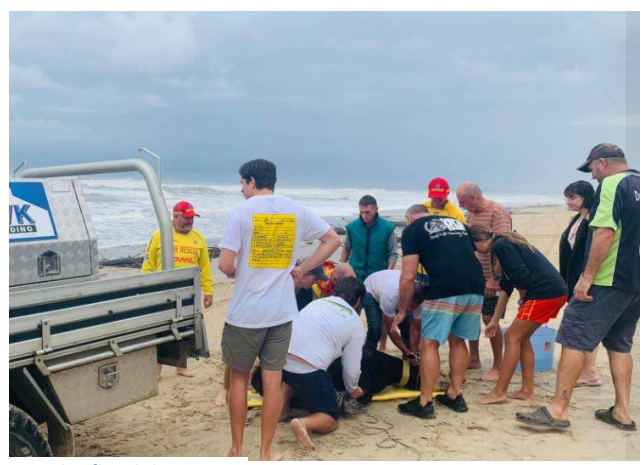
Patrollers & the Community assisting during the flood disaster