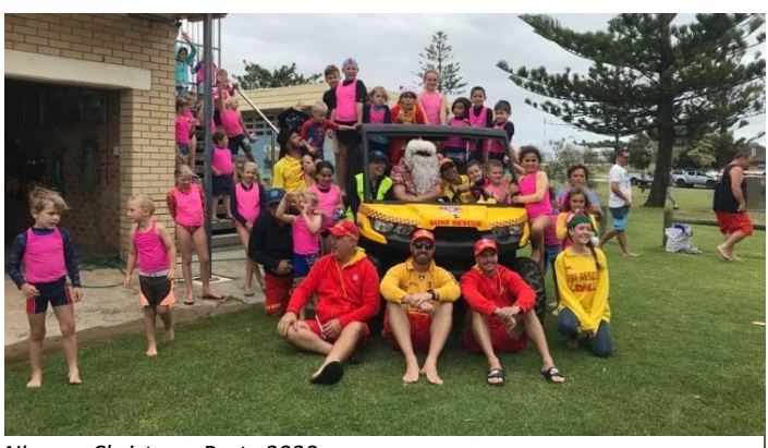
Nippers Christmas Party 2020