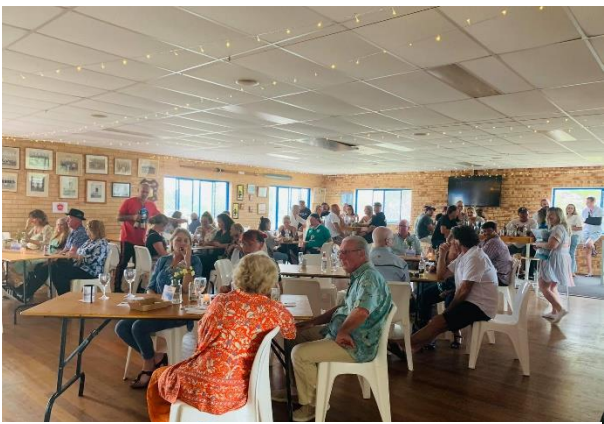
Community Members at our band fundraiser

overseeing the building committee, who are assisting with this capital works project. This is far from an easy task. Funding bodies, contractors and community members have a vested interest in all we do, and this makes the job, at times almost 7 days a week.