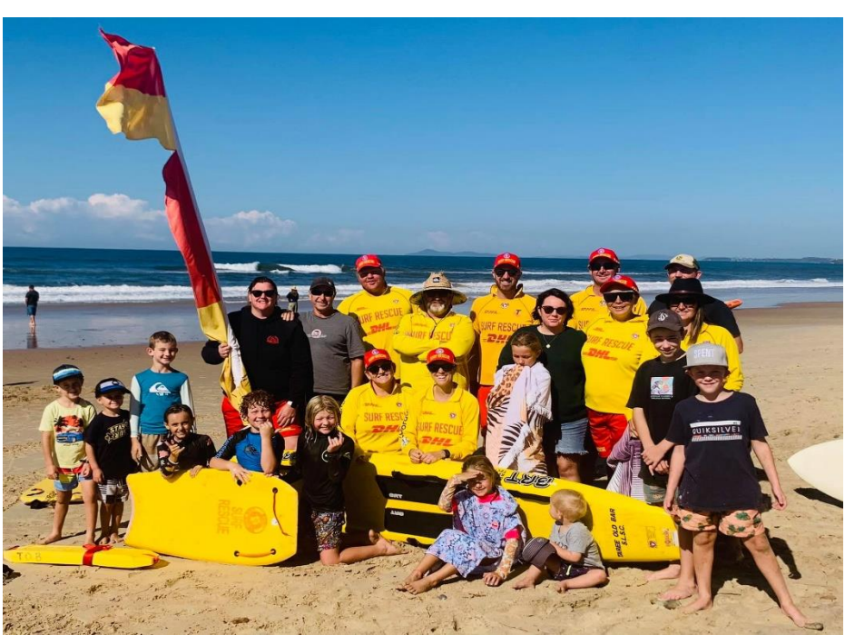
Last day of Patrol 2021