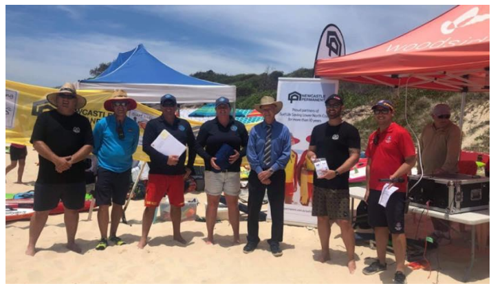
Members receiving Premier's Commendations for the 2019 Bushfires

of the club for a number of years- this award is very significant.