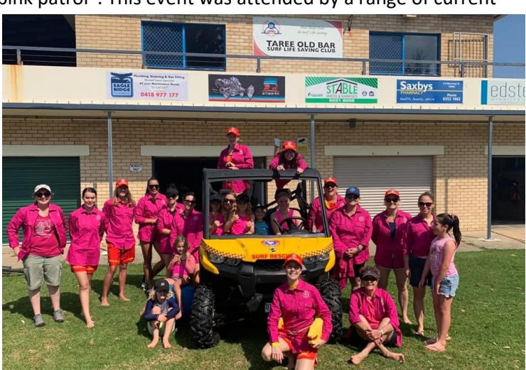
Our "Pink Patrol" attendees

female members, including juniors, SRC's, New Bronzers, Current bronze holders, associates, and life members. To add to the occasion, the patrol was held to commemorate the 40<sup>th</sup> anniversary of the assessment of TOBSLSC's first female bronze squad, which was the second ever in NSW. TOBSLSC is proud of its female members, past present and potential.