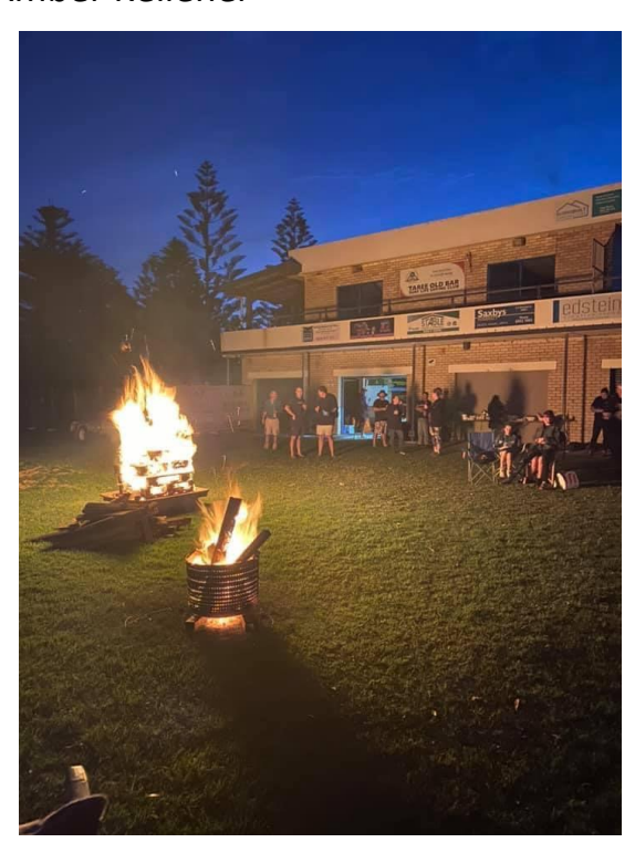
Members end of year celebration